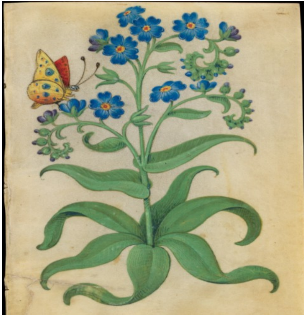
Forget-Me-Not Master Claude de France Book of Flower Studies, c1500-1515